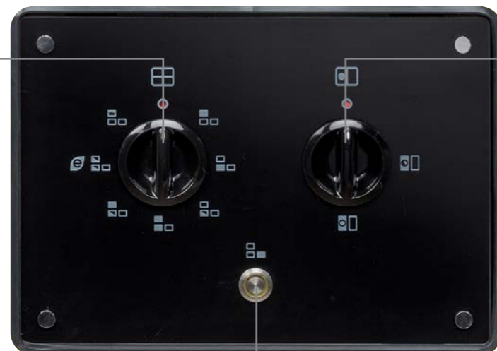
Warming oven switch