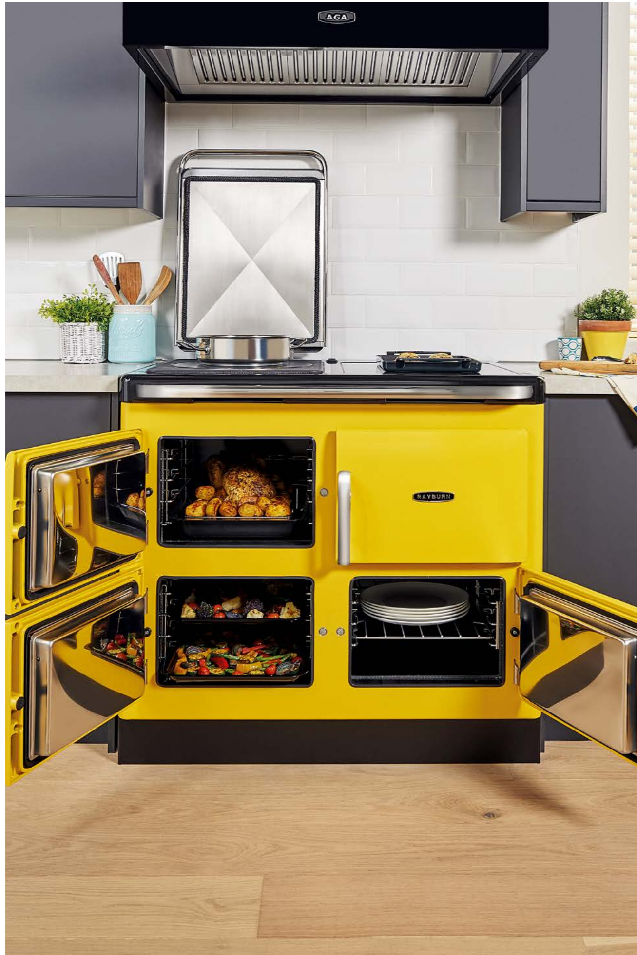
Above: AGA Rayburn Ranger® in Sunshine