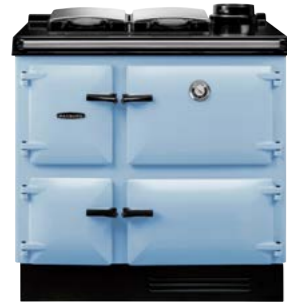
Duck Egg Blue