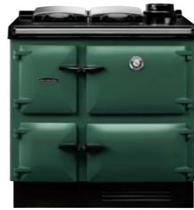
British Racing Green